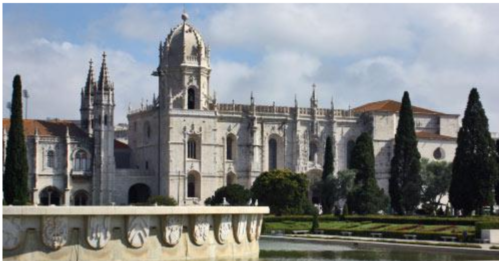
The Baixa district and Rossio square as viewed from the Elevador de Santa Justa

Hotel Roma has 24-hour, multilingual reception, a concierge and lift, and rooms are air-conditioned and have cable/satellite TV, hair dryers, etc. The hotel also offers a dry cleaning and laundry service, currency exchange, safe-deposit box and souvenir/gift shop.